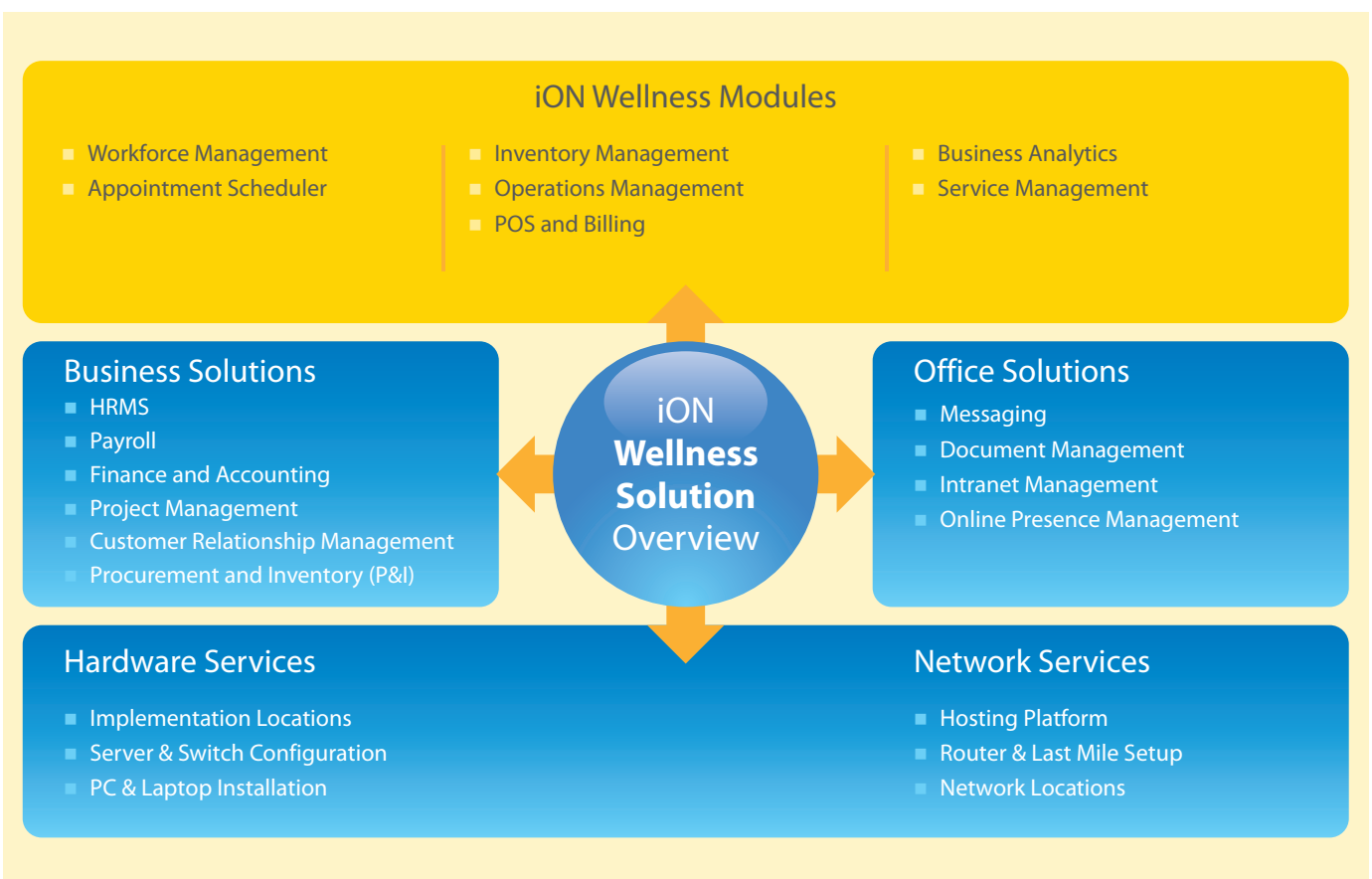
An overview of our iON Wellness Solution

CEO, Kaya Skin Clinic, a chain of 100 clinics across India and the Middle East