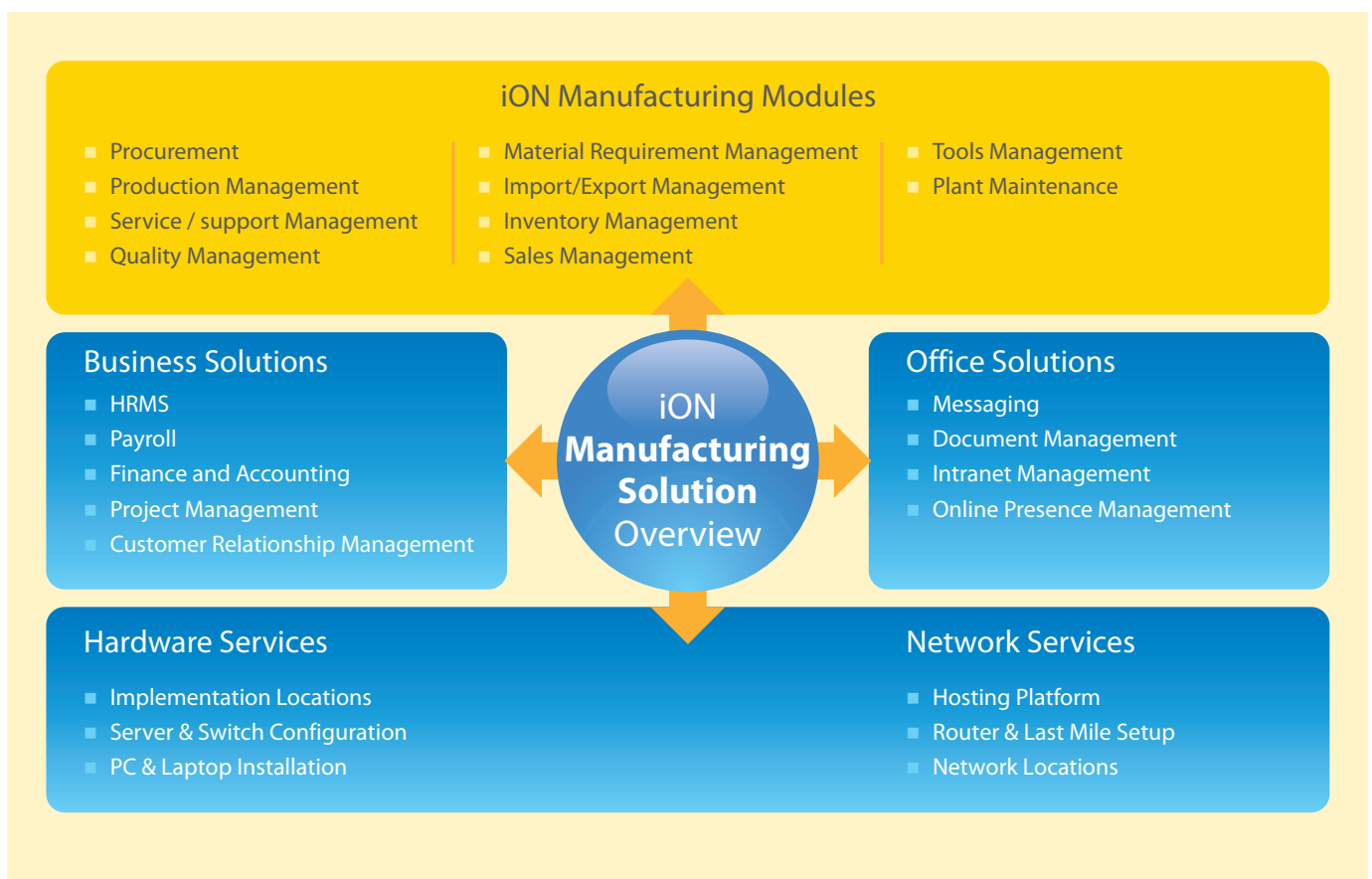
An overview of our Manufacturing Solution

Group IS & Lean Director, United Biscuits