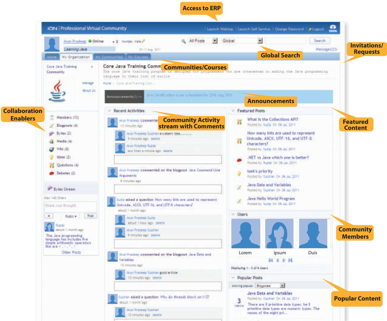
An iON PVC Community Snapshot